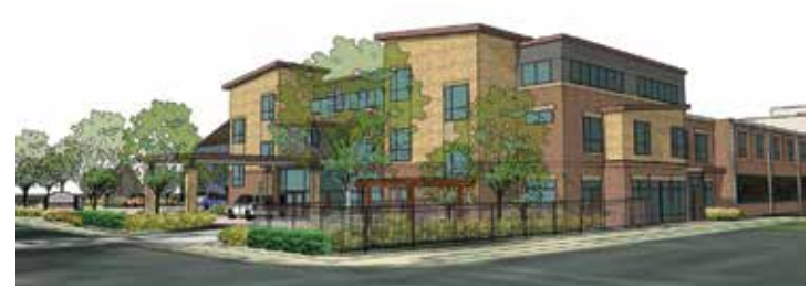
The bright, cheery Adult Day department will be more efficiently configured for optimal use. The outdoor courtyard will offer another safe, relaxing space for clients.

"Love does not overcome your lack of endurance. There are a lot of challenges involved when taking care of an aging adult. Mother has really blossomed in adult day," said a client's daughter.